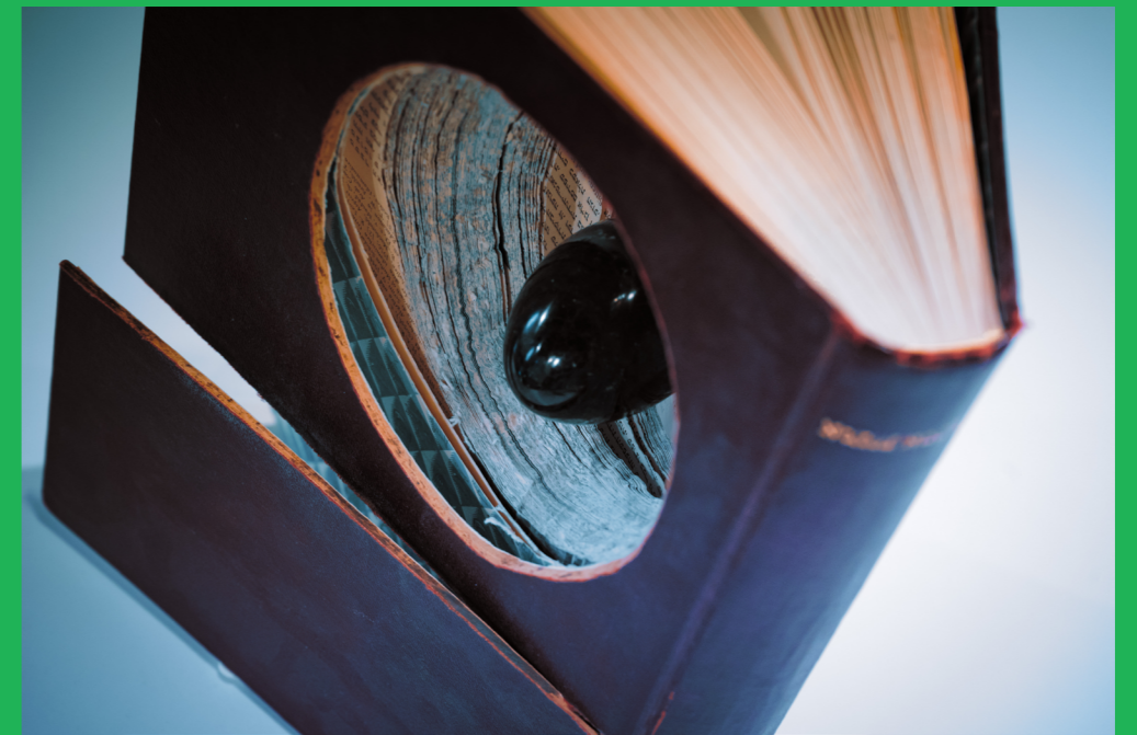
The serpent was more crafty than any of wild animal Genesis 3:1 - ramon stone, ceasar stone, iron, book - 33x30x30 cm - 2020