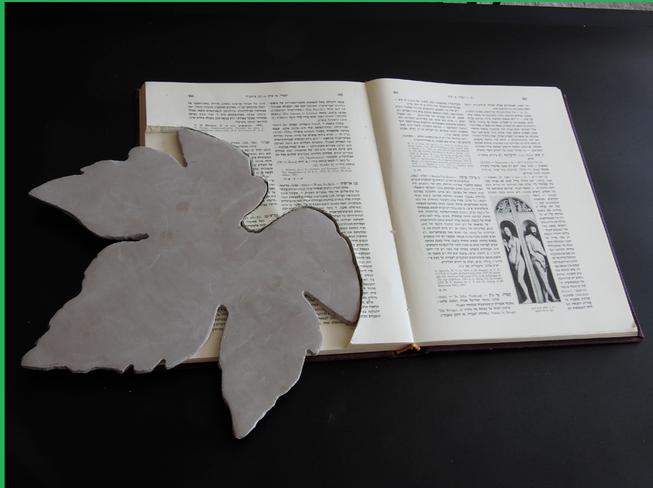
And they realized they were naked Genesis 3:7 - porcelaingres, book- 60x40x3 cm - 2020