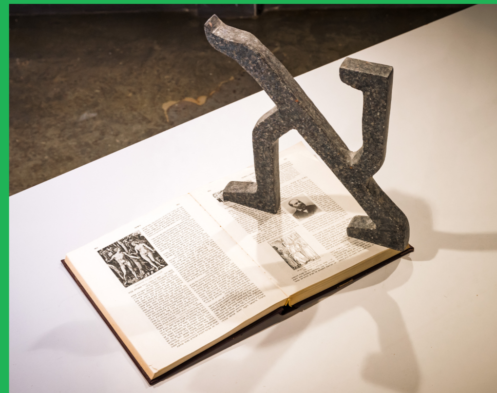
Sound of lord god as he was walking in the garden Genèse 3:8 - Ceasar stone and book - 30x46x30 cm - 2020