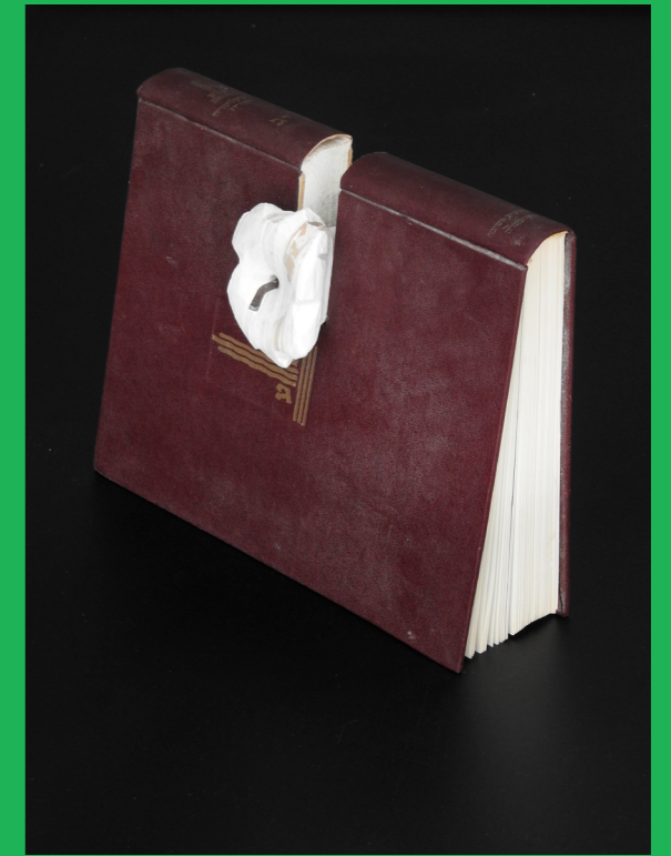
Have you eaten ? Genesis 3:11 - athmon stone, iron, book - 30x23x10 cm - 2020