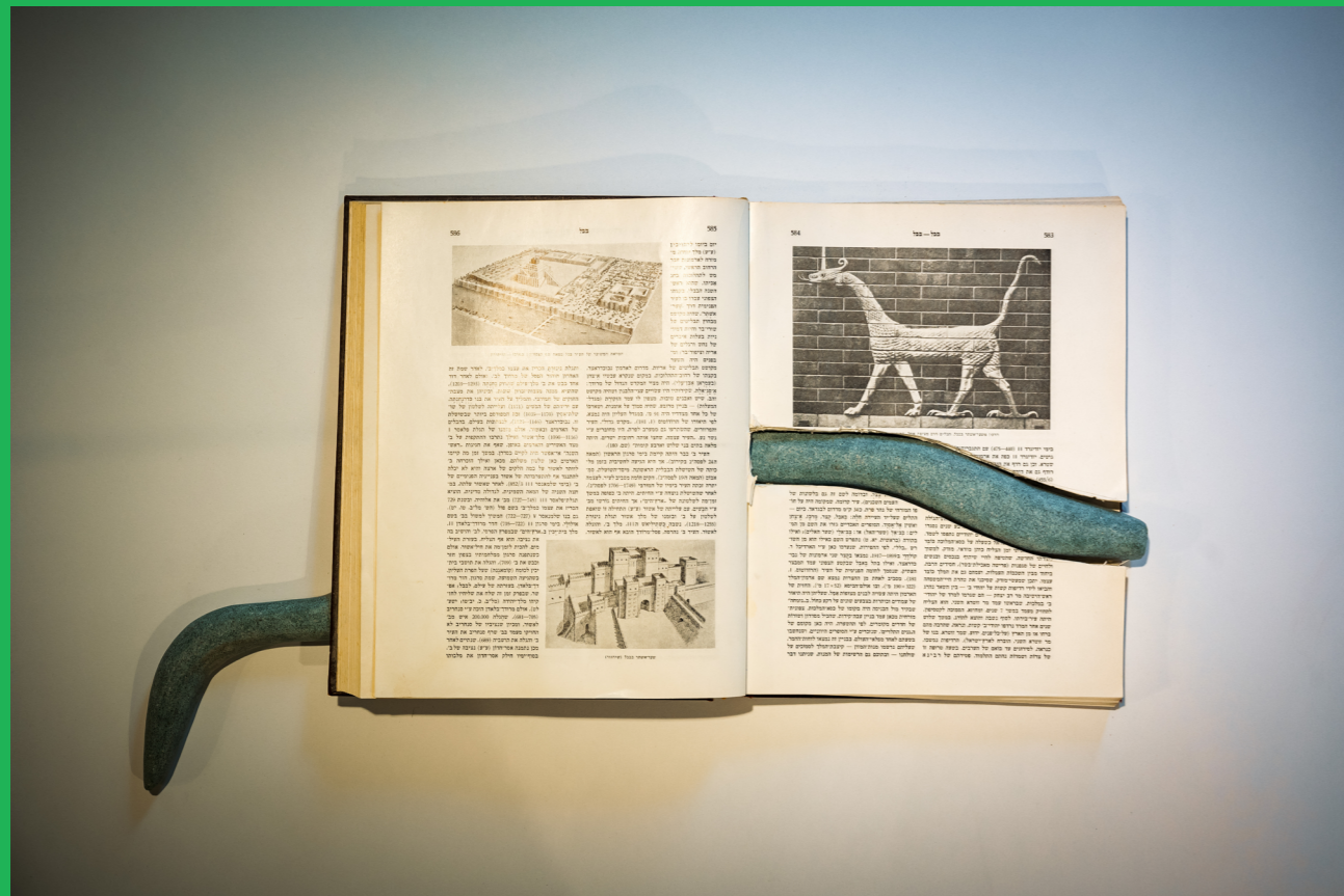
You will crawl on your belly Genesis 3:14 - ceasar stone, book - 3x65x30 cm - 2020