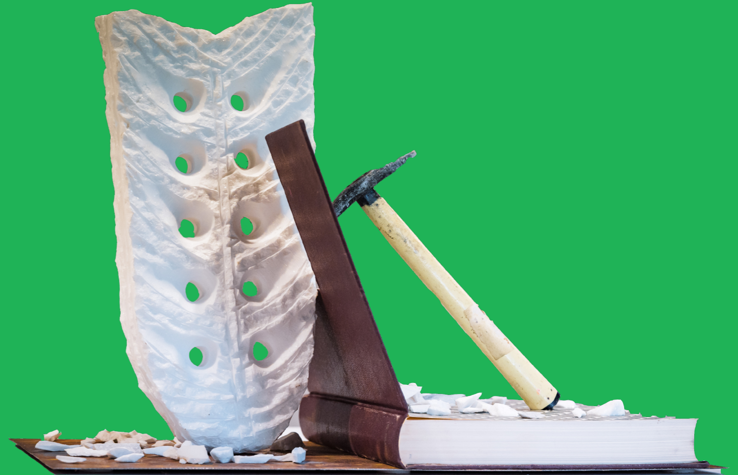
By the sweat of your brow you will eat your food Genesis 3:19 - greek marble, iron, hammer, book 25x40x50 cm - 2020