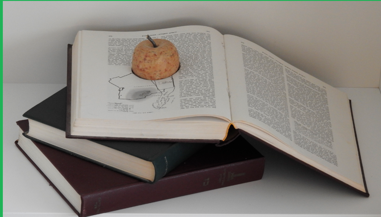
Tree of knowledge Genesis 3:5 - ramon stone ,iron , books - 17x50x40 cm - 2020