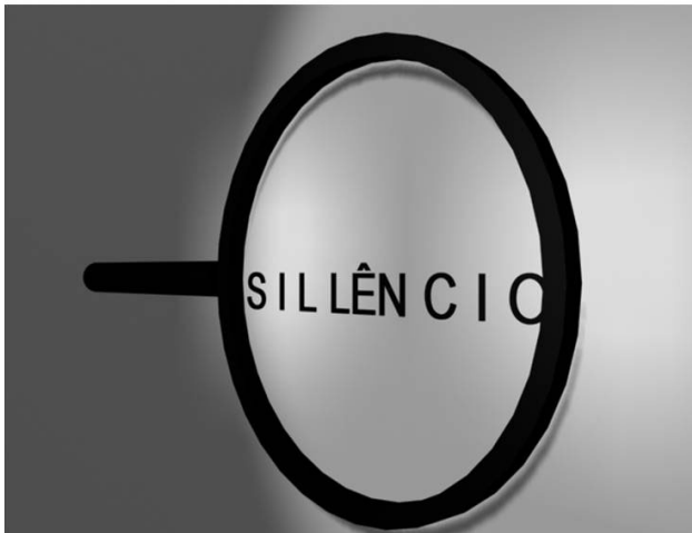
Luz Fandino - Silence project - detail - 2014

LUZ FANDINO presents Silence , a project of an installation dedicated to public space. This project is about silence and meditation. It is composed by an aestheticized image of the moon, transposed onto delicate transparent tracing paper, seen through an old camera system. The observer became temporarily disabled visually is forced to focus on the magnifying glass to read the image and the registered overlay in a system of two-room box message.